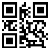
(*) Minimum number of scanning characters of Industrial 25 being 4

Scan the two-dimensional codes below to set the maximum number of scanning characters of Industrial 25