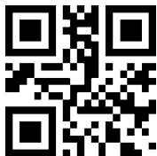
(*) Not to read Code32

Scan the two-dimensional codes below to read/not to read Code32